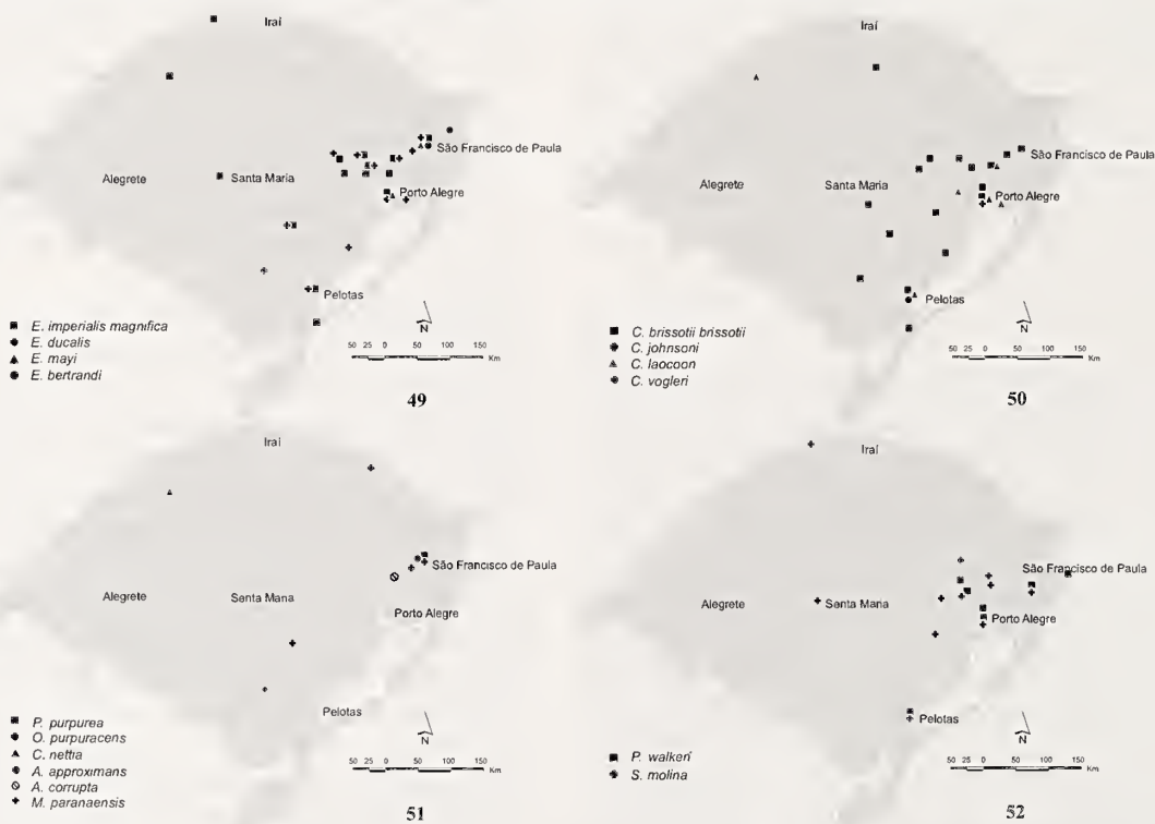
FIGS. 49–52. Distribution maps of Ceratocampinae of Rio Grande do Sul, Brazil. 49. Eacles imperialis magnifica , E. ducalis , E. mayi , and E. bertrandi . 50. Citheronia brissotii brissotii , C. johnsoni , C. laocoon , and C. vogleri . 51. Proclitronia purpurea , Othorene purpurascens , Cicia nettia , Alneidella approximans , A. corrupta , and Mielkesia paranaensis . 52. Psilopygida walkeri and Syssphinx molina .